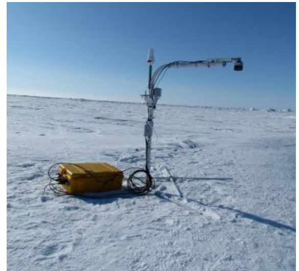
CEOS station with beadedstream Digital Temperature Cables integrated into sea ice mass balance buoys,

In the realm of Arctic environmental monitoring, CEOS faces the formidable challenge of obtaining reliable data sets. The research involves investigating the intricate interplay of heat exchange within the Arctic environment, particularly in locations critical to global climate studies such as the Beaufort Sea, Daneborg, Greenland, and Station Nord, Greenland. Existing buoys, strategically installed in these locations, seek to provide insights into the complex dynamics of ice growth and melt. However, the harsh and remote conditions of the Arctic make data collection both expensive and difficult.