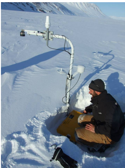
A staff member secures a Campbell Scientific data logger underground, ensuring precise temperature monitoring for CEOS at the Arctic station.